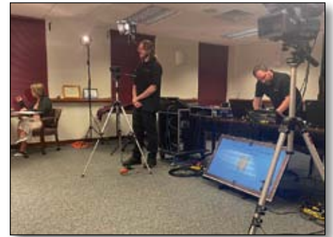
Technical professionals from Markey's broadcasting & media production lend their expertise for the event.

He also spoke about weathering the storms of the coronavirus (COVID-19) pandemic and expressed that the biggest challenge now is staffing. He shared some recruitment and retention strategies designed to combat the fierce competition for a limited workforce. He also touched on the official opening of the new youth group